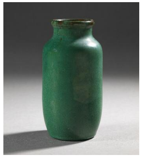
Fig. 2 - Vase from Don Valley, Toronto, Ontario. ROM Accession: 923.42.9.