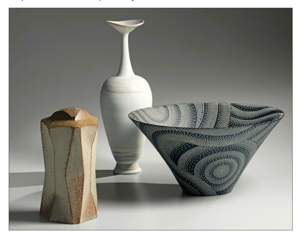
Fig. 1 (left to right)

Gardiner Museum is to offer an intriguing and exciting glimpse into this diverse clay culture. Each separate show has a different theme. The first, Japan Now: Form + Function, features vessels created for use with floral displays or referring, sometimes rather loosely, to that function (Fig. 1). As Japanese ceramics have evolved through the centuries, form has always played the central role in their aesthetics. Potters have developed new shapes and techniques based on indigenous regional styles or ancient prototypes, or inspired by Korean, Chinese, or Western